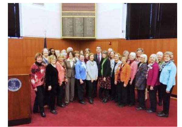
Gov. Northam meets with State Lobby Day participants in January, 2018.

State Lobby Day is preceded by the AAUW of Virginia Women Legislators' Reception on February 6 in Richmond.