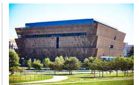
National Museum of African American History and Culture