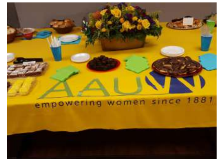
AAUW of Virginia reception for women legislators and staff the evening before Lobby Day.