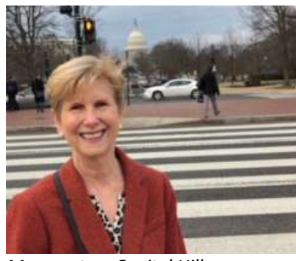
Margaret on Capitol Hill

One of AAUW's priorities is to "achieve economic self-sufficiency for all women including pay equity and fairness." The Paycheck Fairness Act is comprehensive and addresses the following: