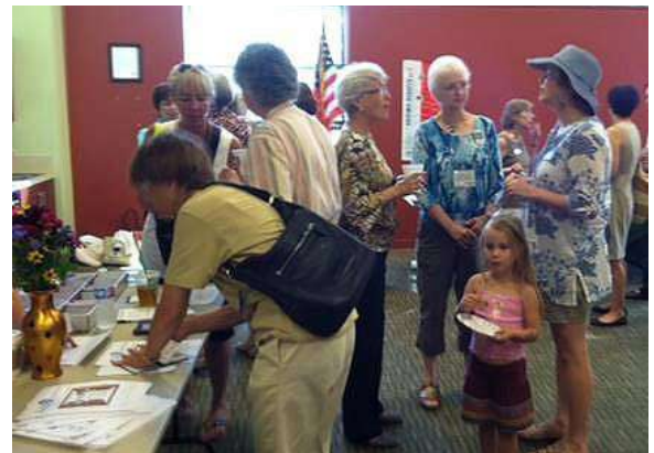
Members and visitors at a prior Open House

Saturday, September 7, 2019 10 to Noon Patrick Henry Library, Vienna