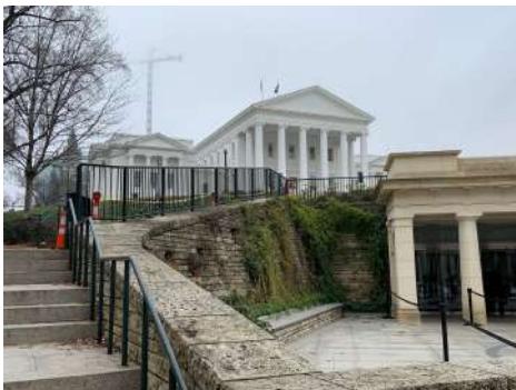
Virginia State Capitol in Richmond on January 15, 2020, when AAUW-VA members lobbied to eliminate the gender pay gap in Virginia.