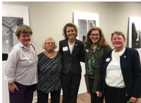
Some of the members who attended the reception hosted by AAUW-VA for Virginia women legislators on January 14, 2020.