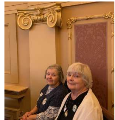
Members in the House of Delegates Gallery before the historic vote on the ERA.