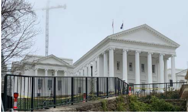
Virginia State Capitol.

[Editor's Note: The Special Session of the Virginia Legislature is projected to end February 27, after this newsletter is distributed. For the latest status of HB 2137, check the link below.]